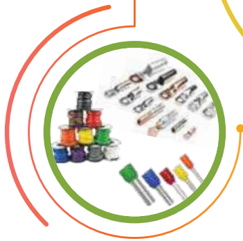
GI Copper Strips & Wires Ferrule + Markers