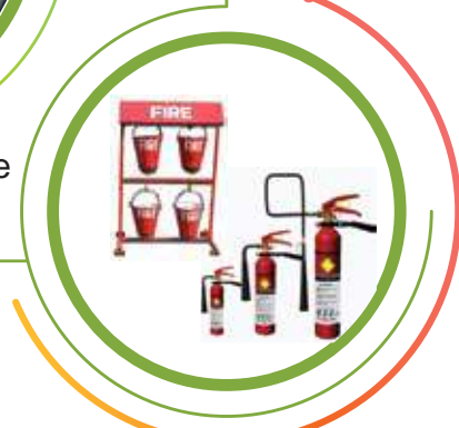
Fire Extinguisher Fire Buckets