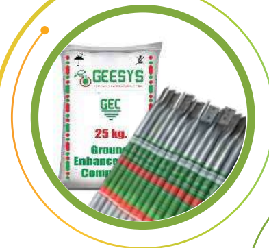
Earthing Electrode with Mineral