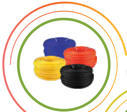
Solar DC/AC Cable