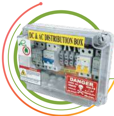
DC & AC Distribution Box